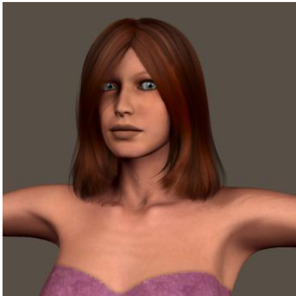
Gamma = Off