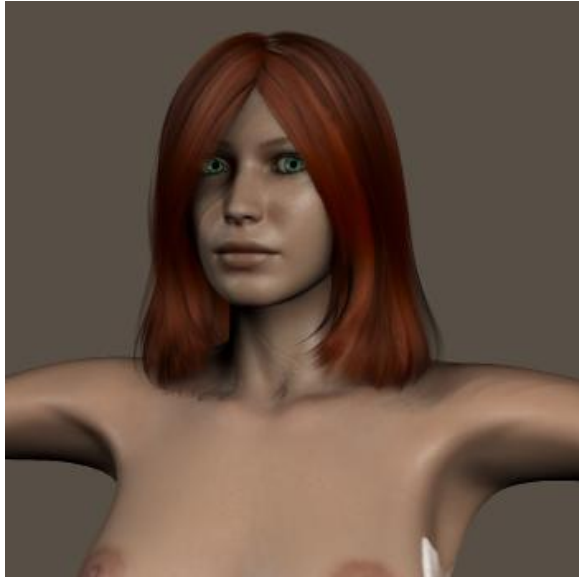
Gamma = Off

Anahi INJ from DAZ 3D. SSS MAT. Diffuse = Black Note: this is a brown skin tone