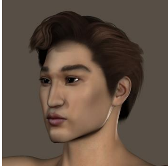
Sojoon with skin textures

The SoJoon ad and ReadMe file both stated that INJ Muscle and INJ Elite were also required, but unless you want to modify the character's body, they aren't really needed (I may find out differently some day.)