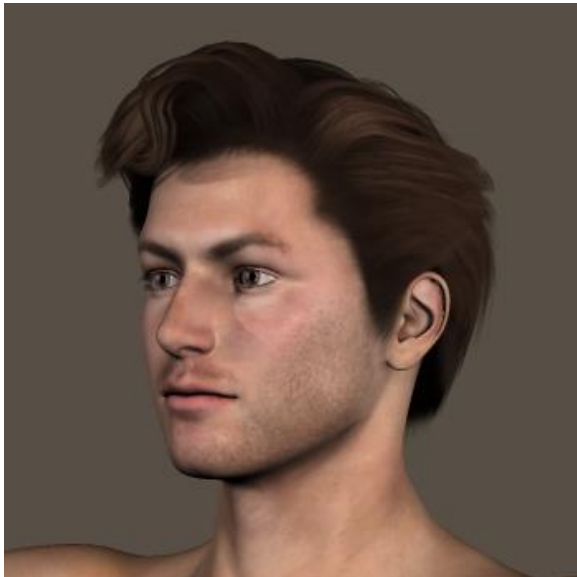
Michael 4 - Default

Morphs++ is used only to provide Properties dials that the INJ file uses to change the head or body appearance of your new character, so if the INJ Morphs++ file is not loaded, your new character will not look as you expected! Let me illustrate the conversion of Michael 4 (with Rievel hair) to Silverwind3D's SoJoon character: