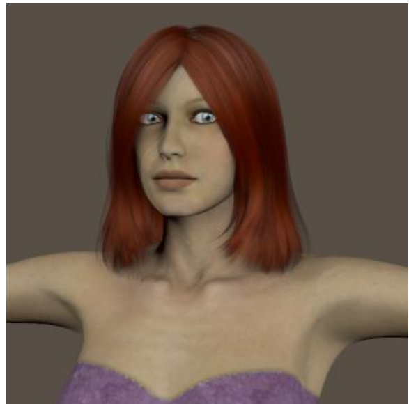
Gamma = 2.20