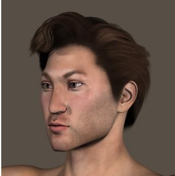
M4 + Sojoon Head INJ after loading INJ Morphs++