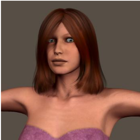
Gamma = Off

Victoria 4.2 with her default blue-green Diffuse: