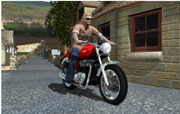
No Motion Blur

Enter 1 in the Frame counter window and Render the scene.