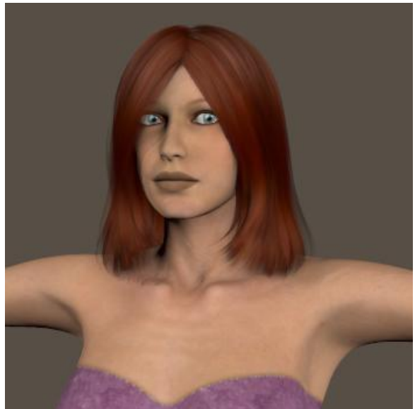
Gamma = 2.20