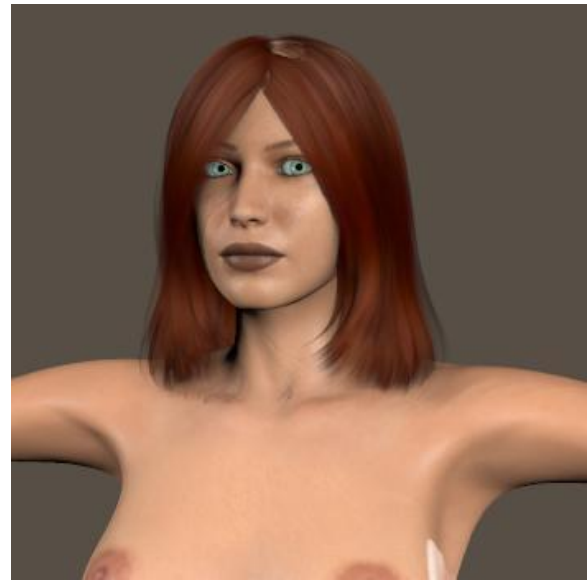
Gamma = 2.20. Brown is gone!