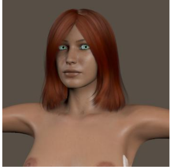
Gamma = 2.20