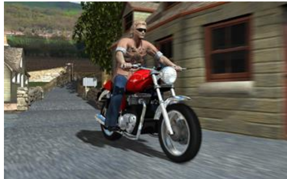
With Motion Blur

If this doesn't look good, go back to Frame 2 and select items to change.